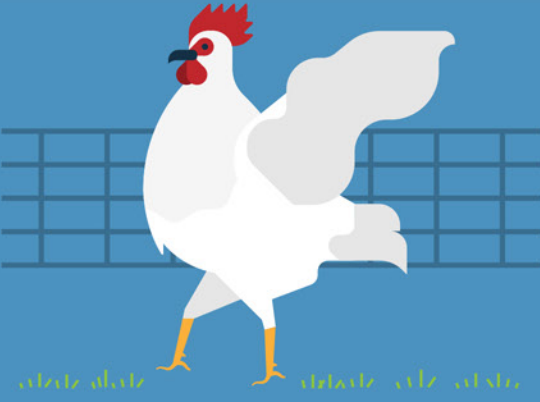
Freedom to Move