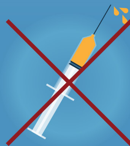
Responsible Antibiotic Use